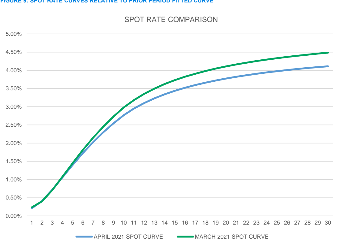
FIGURE 9: SPOT RATE CURVES RELATIVE TO PRIOR PERIOD FITTED CURVE